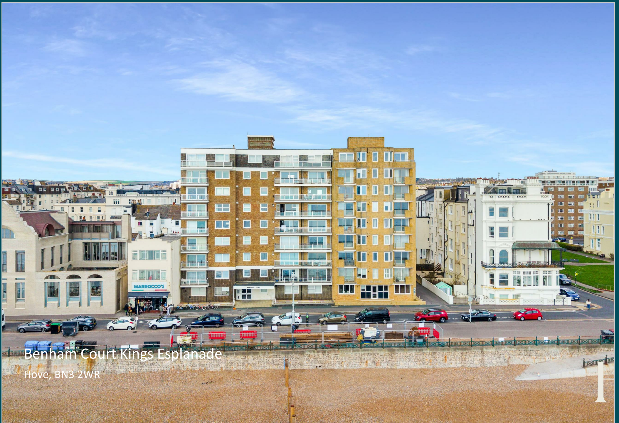
Benham Court Kings Esplanade Hove, BN3 2WR